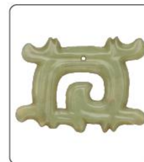
jade plaque, c3500–c2000 BC

Jade is a hard and rare stone, made from the mineral nephrite, which is difficult to shape and carve. Jade was used for jewellery, ornaments, weapons, tools and ritual objects. It was precious and a symbol of purity and virtue.