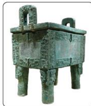
Houmuwu ding from Yinxu

Bronzeworking skills were a major advance during the Shang Dynasty. People learned to smelt copper, tin and lead to make bronze. Skilled craftspeople created vessels that were used for rituals and offerings to the gods. Bronze weapons, such as daggers and spearheads, also gave the Shang Dynasty warriors an advantage over their enemies.