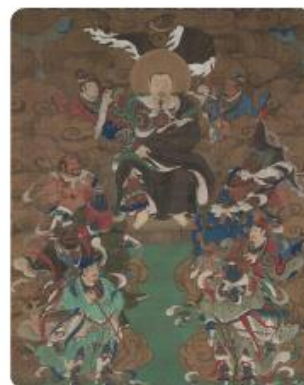
Shangdi surrounded by attendants

People in the Shang Dynasty worshipped the king of the gods, Shangdi. They also prayed to lesser gods who controlled aspects of the world, such as the sun, wind, rain and moon. People made offerings and sacrifices to please their deceased ancestors. They believed that the soul lived after death, so they buried ritual vessels containing food and drink, for the dead to use in the afterlife.